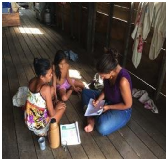
Community: Sagrado Coração de Jesus (2017) - photographic register of fieldwork