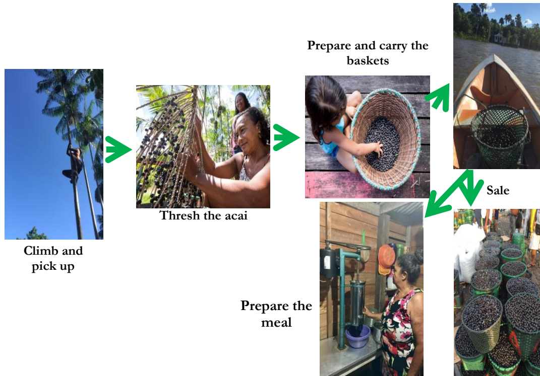
Figure 4 – 3: Divisions of Labour: Açai Production Chain