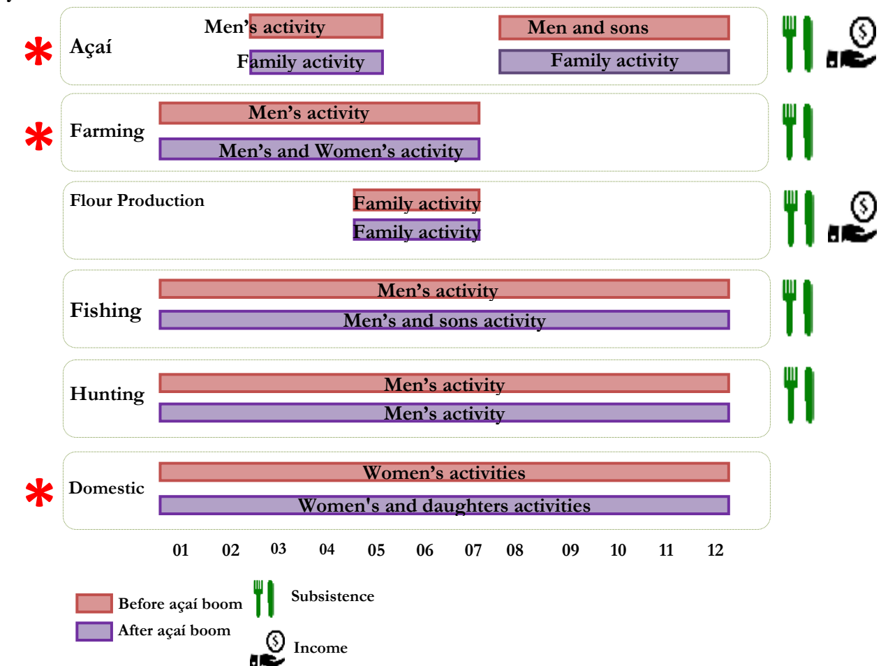
Figure 4 – 1: Redistribution of tasks throughout the year

The açai market's expansion demanded a redistribution of tasks among family's members, being necessary to incorporate children in tasks, including in domestic activities and fishing. Because of the daughters' help in the household activities, the women are acquired more agricultural responsibilities'. The açai activities began to be exercised by all the members of the families, seeking to guarantee the fruit supply and generate more income for the family. These labour divisions have resulted in women's accumulation of responsibilities activities. This new family's tasks context is a result of the açai global value chain that impacts in the family, community and local market dynamics.