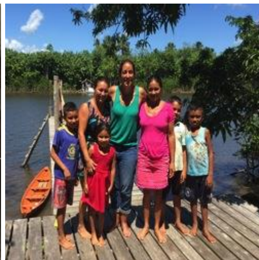
Community: Palestina (2017) - photographic register of fieldwork